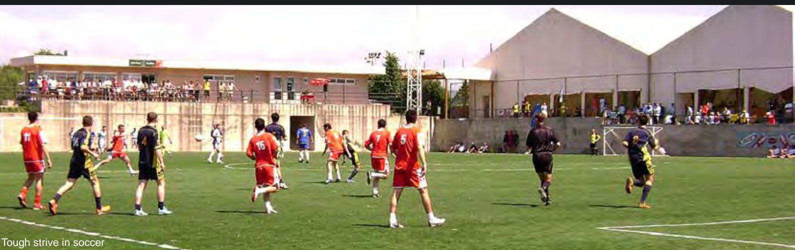
Tough strive in soccer