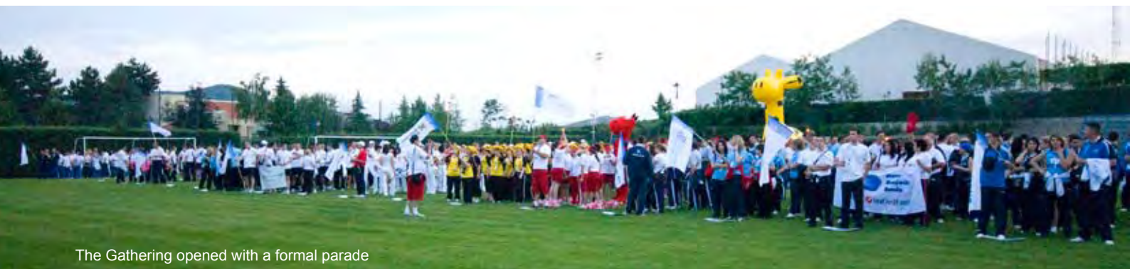
The Gathering opened with a formal parade

In six sports disciplines, soccer, basketball, volleyball, bowling, table tennis and chess, there were teams from 26 banks competing, Central Bank of BiH, Banking Agency of the FBiH, Banking Agency of RS, Deposit Insurance Agency of BiH, and other financial institutions of BiH and RS