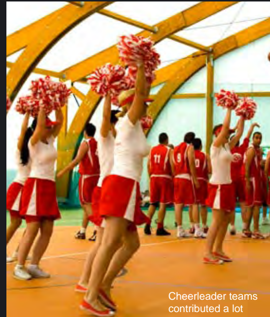
Cheerleader teams contributed a lot