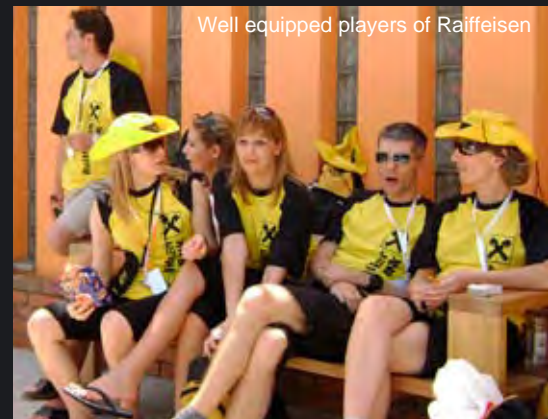
Well equipped players of Raiffeisen

Certainly, the great contribution for the overall image of ProCredit bank, that received the prize for this, was made by their cheerleader team. Like NBA cheerleader team, the attractive cheerleader ladies of ProCredit, were encouraging their teams and probably contributed to the high score of their bank.