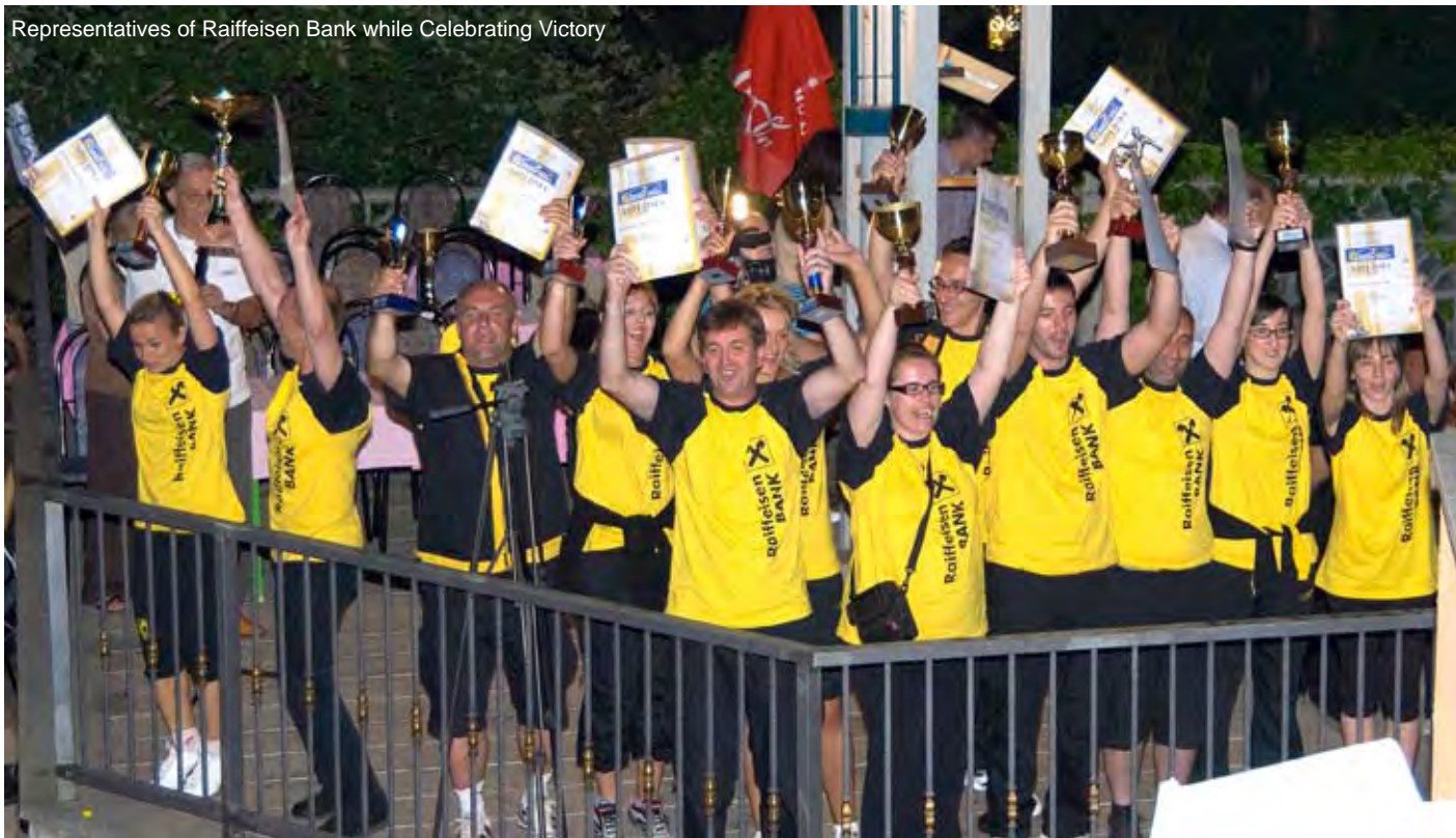
Representatives of Raiffeisen Bank while Celebrating Victory

the first place in bowling, Raiffeisen bank second place, and Nova Banja lučka Bank the third place. In the category men in bowling, VolksBank AD Banja Luka also won the first place, second by Raiffaisen bank, and Hypo Alpe Adria Bank Banja Luka was at the third place.